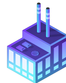
SUBSTATION CONNECTIVITY UPGRADES